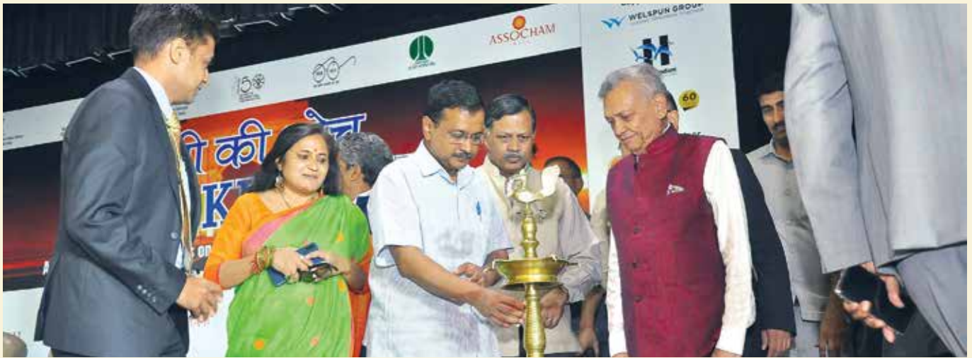
Lighting of Lamp by Chief Guest Shri Arvind Kejriwal, Hon'ble Chief Minister, Govt. of NCT of Delhi at the ASSOCHAM DILLI KI SOCH - A Discussion of Stakeholders on Governance & Development of Delhi.