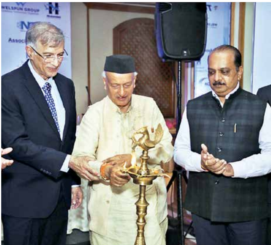
Hon'ble Governor of Maharashtra Shri Bhagat Singh Koshyari Inaugurating ASSOCHAM's National Conference & Awards on Cold Chain – Technologies, Convergence and Capacity Building, Mumbai

Bhagat Singh Koshyari Governor of Maharashtra