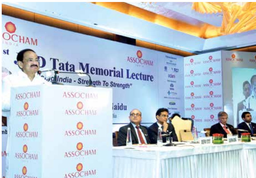
Shri M. Venkaiah Naidu, Hon'ble Vice President of India delivering lecture at '21 st JRD Tata Memorial Lecture 2019'.