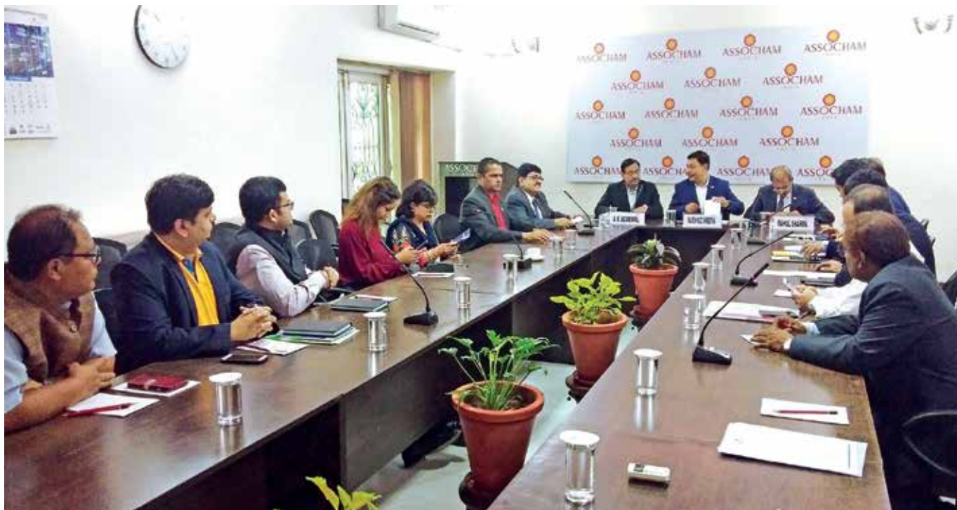
Meeting with business delegation from Nepal Chamber of Commerce on 19 th October, 2019.