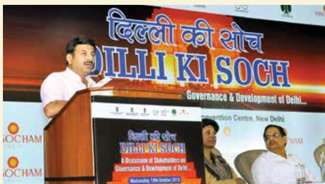
Shri Manoj Tiwari, Hon'ble Member of Parliament & President of the BJP Delhi Unit at the ASSOCHAM DILLI KI SOCH - A Discussion of Stakeholders on Governance & Development of Delhi.