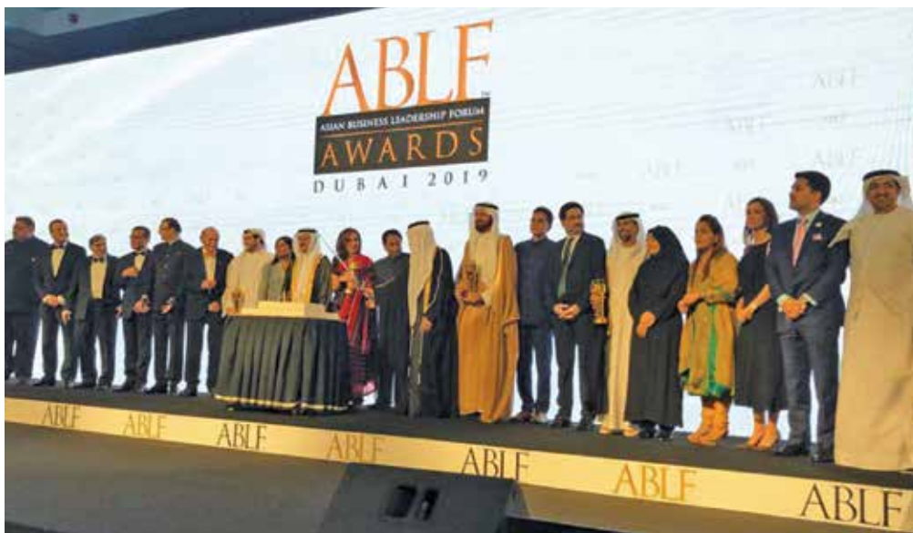
Galaxy of awardees at ABLF Award Ceremony in presence of Excellencies from India and UAE.