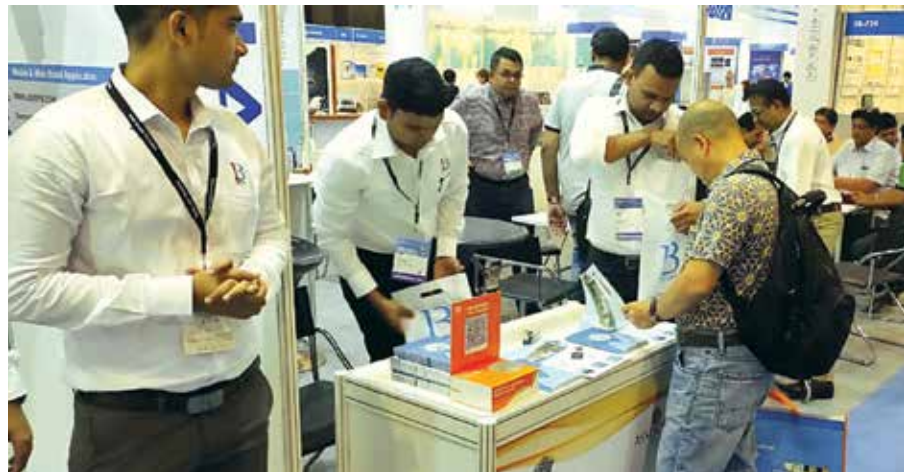
A view of exhibition hall.

Buyer Forums, Product Demo and Launch Pad sessions, as well as networking receptions were held during the Fair to let the industry learn about the latest market