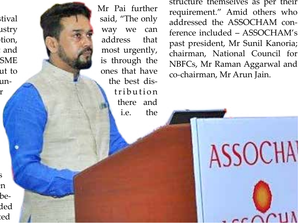
Shri Anurag Singh Thakur, Hon'ble Minister of State for Finance, Government of India addressing the conference.