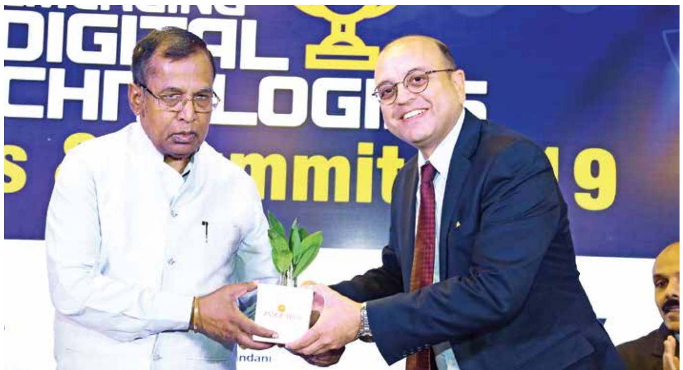
Shri Deepak Sood, Secretary General, ASSOCHAM welcoming Shri Som Parkash, Hon'ble Minister of State, Ministry of Commerce & Industry, Government of India

Som Parkash, Hon'ble Minister of State, Ministry of Commerce & Industry