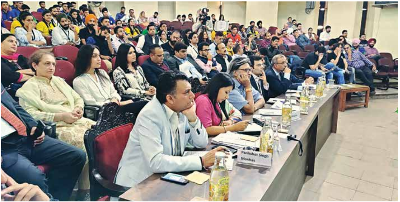
Jury Members along with participants during ASSOCHAM STARTUP LAUNCHPAD, Jammu held on 30.10.2019 at Jammu University.