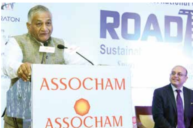
General (Retd) V. K. Singh, Hon'ble Minister of State for Road Transport & Highways addressing the 5 th International Conference ROADTECH -Roads and Highways Smart Use of Available Resources for Green and Sustainable Road.

Mr.VineetAgarwal, Vice President ASSOCHAM said, Sustainable roads and road safety need to be integrated in all the phases of planning, design and operation of road infrastructure. Road safety management and enforcement of traffic safety regulations have not kept pace with the development. New technologies and value engineering can play a major role in making roads and highways sustainable and safe.