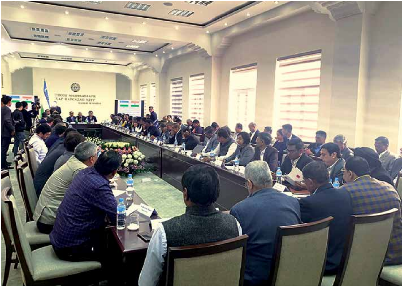
Indian Business Delegation during the round table discussion