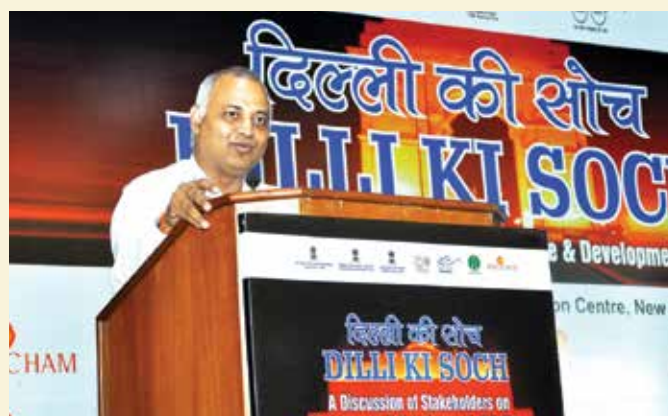
Shri Somnath Bharti, Hon'ble Member of Legislative Assembly addressing the delegates at the ASSOCHAM DILLI KI SOCH - A Discussion of Stakeholders on Governance & Development of Delhi.