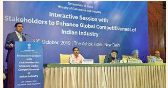
Mr. Sajjan Jindal, Former President of ASSOCHAM addressing the Interactive session with stakeholders to enhance global competitiveness of Indian Industry, October 28, 2019 at New Delhi.