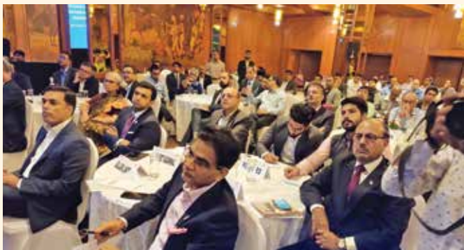
A view of distinguished guests at an Interactive Session with stakeholders to enhance global competitiveness of Indian Industry, October 28, 2019 at New Delhi.