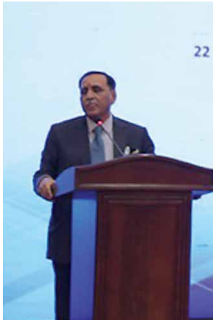
Shri Vijay Rupani, Hon'ble Chief Minister of Gujarat addressing the gathering at Uzbek-Indian Business Forum jointly organized by ASSOCHAM, India and CCI, Uzbekistan.

Shri Vijay Rupani also inaugurated the exhibition based on Mahatma Gandhi's life. The exhibition was organized by the Embassy of India to Uzbekistan in Tashkent. The exhibition was a part of celebration of 150th birth anniversary of Mahatma Gandhi. Furthering with the day, Shri Vijay Rupani paid a visit to Amity University in Tashkent and interacted with students and faculties.