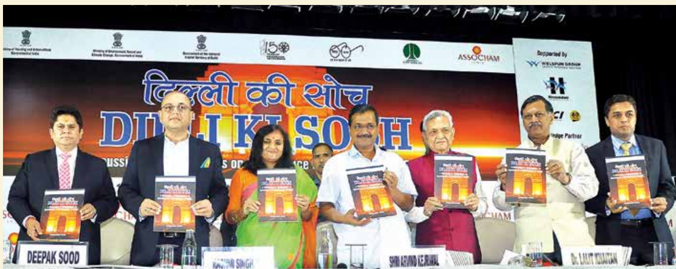
Release of Knowledge Paper by Chief Guest Shri Arvind Kejriwal, Hon'ble Chief Minister, Govt. of NCT of Delhi and Dignitaries at the ASSOCHAM DILLI KI SOCH - A Discussion of Stakeholders on Governance & Development of Delhi held on 16 th October 2019.