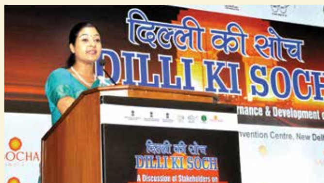
Smt. Alka Lamba, Former MLA addressing the delegates at the ASSOCHAM DILLI KI SOCH - A Discussion of Stakeholders on Governance & Development of Delhi.