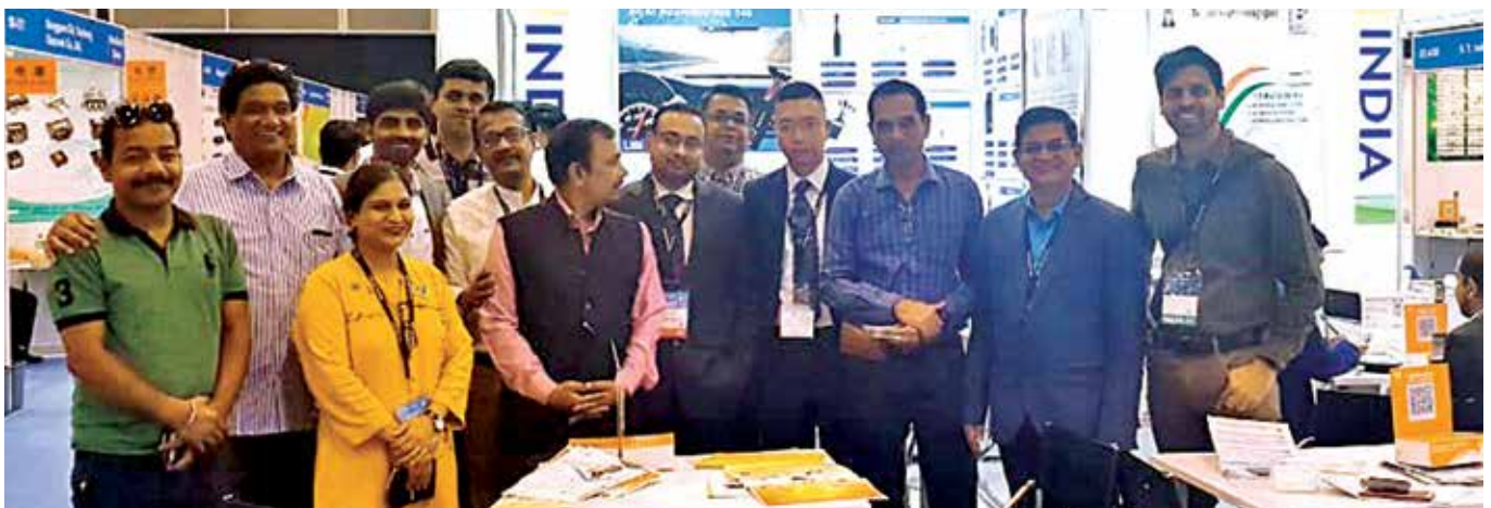
A group picture of members of the Pavilion.

The dedicated India Pavillion was inaugurated by Consul Shri Vikas Garg, Indian Consul General Office at Hong Kong. He interacted with the Indian companies present during the show and wished successful participation. Media coverage by HKTDC daily ensured India Pavilion was well visited.