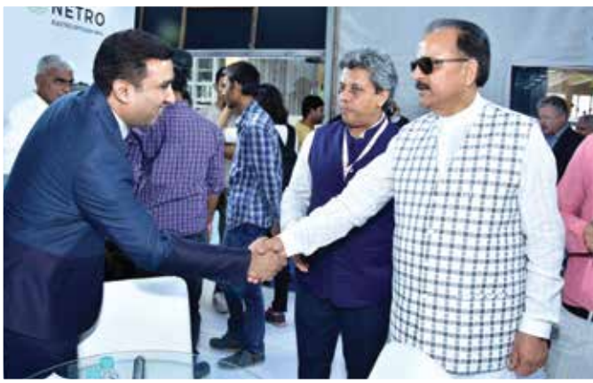
Mr. Ajay Bhatt, Member of Parliament Bhartiya Janta Party at INDIA DEFENCE & SECURITY EXPO 2019 "MAKE IN INDIA 2.0".