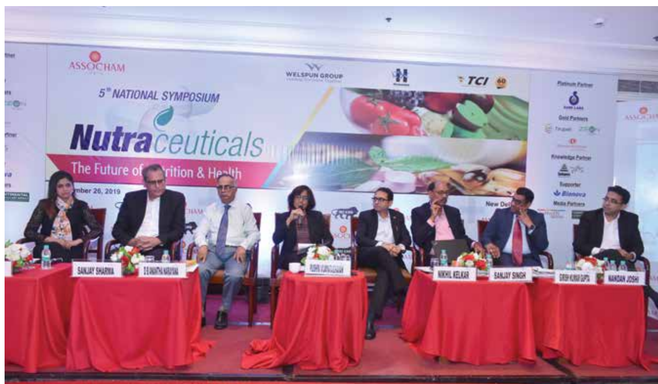
Eminent Dignitaries on the dias addressing the Scientific Session on Advancements in Nutraceutical Science - Prioritising and Value Addition in Human Nutrition and Health