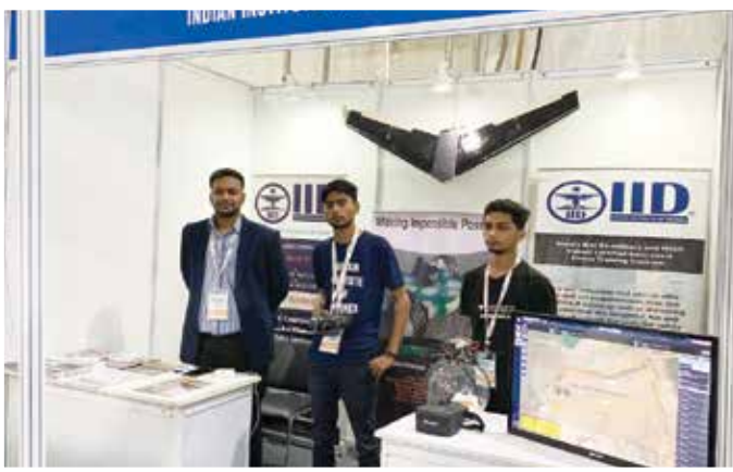
A view of INDIA DEFENCE & SECURITY EXPO 2019 "MAKE IN INDIA 2.0"