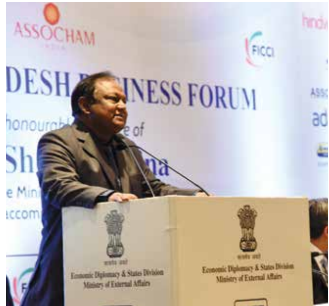
Mr. Tipu Munshi, Hon'ble Minister for Commerce, Government of Bangladesh addressing the India - Bangladesh Business Forum (IBBF) in New Delhi

Mr Piyush Goyal, Minister for Commerce & Industry and Railways, Govt of India said, India stands committed to every request that Bangladesh will make on the railway sector. He expressed his hope to see in the very near future, an end to end connectivity with Bangladesh and a seamless corridor that facilitate people and goods movement from either side.