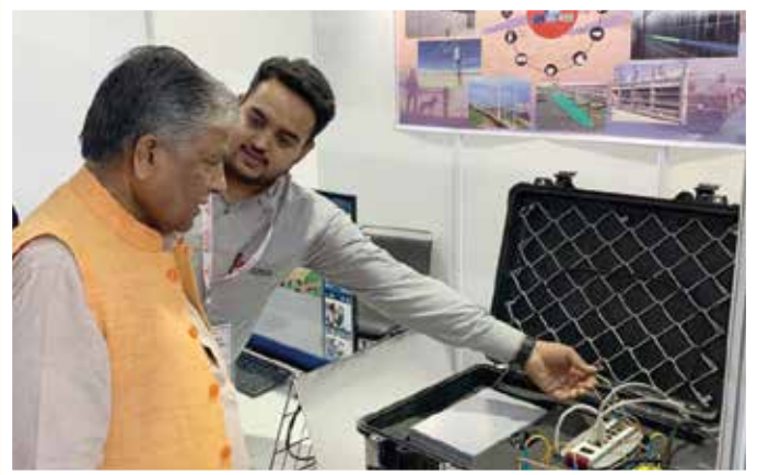
A view of INDIA DEFENCE & SECURITY EXPO 2019 "MAKE IN INDIA 2.0"