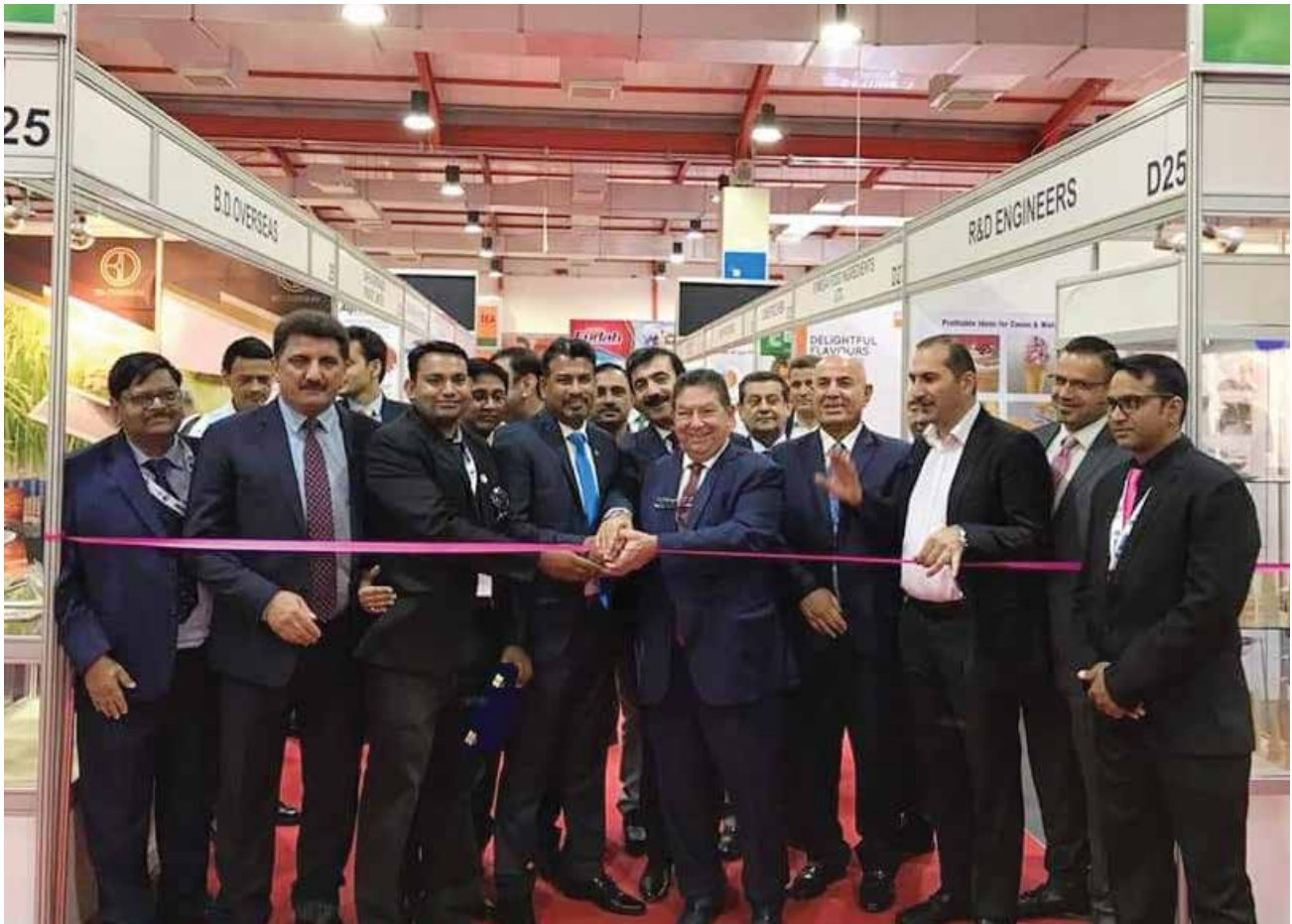
Shri Chandramouli Kern, Consulate General of India at Kurdistan Region, Iraq inaugurating the India Pavilion organized by ASSOCHAM at Iraq Agrofood Erbil 2019