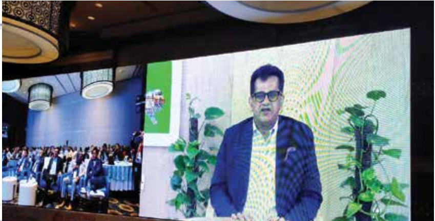
Shri Amitabh Kant, Chief Executive Officer, NITI Aayog addressing the participants during ASSOCHAM Startup Launchpad at Pune

The present union government gave much needed relief to startups and investors in India by doing away with angel tax, which would have continued unabated for a long period of time had there been any other government, NITI Aayog CEO, Mr Amitabh Kant said at an ASSOCHAM event held in Pune on Saturday.