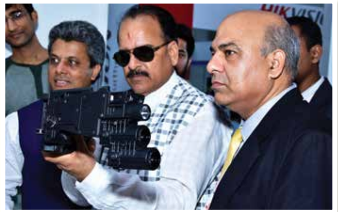
Mr. Ajay Bhatt, Member of Parliament Bhartiya Janta Party at INDIA DEFENCE & SECURITY EXPO 2019 "MAKE IN INDIA 2.0".