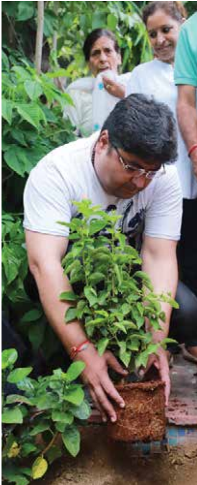
Tree Plantation drive on 28th September at Kirti Nagar

Noida Sector 137 have taken a step forward to fight this problem by giving up worry and acting upon it. ASSOCHAM and ITC's initiative 'Illness to Wellness' saw a large number of local residents and green partners 'Volunteers 137' joining the tree plantation drive. The event started at 8 am on Sunday in Central Park where the residents of Sector 137 took part and planted Neem, Ashoka, Amaltas, Madhumati, and Giloe trees. People of all ages attended the event, but special enthusiasm was seen among the children for planting trees. Some young children were seen helping one another to plant trees and water them. Many people present at the event took a green selfie and