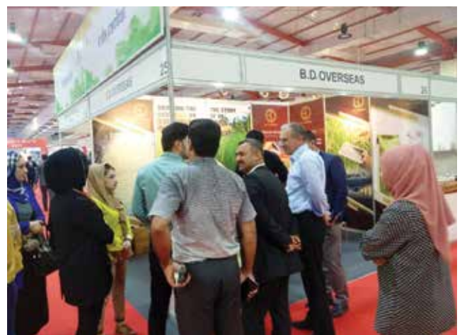
Visitors at Indian Pavilion in Iraq Agrofood Erbil 2019