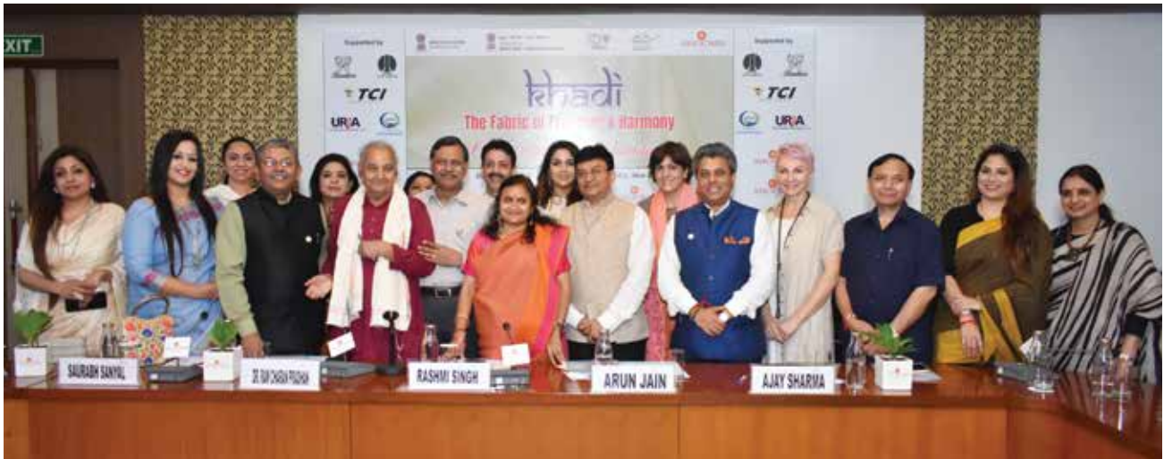
Eminent Panel of Speakers at the ASSOCHAM: KHADI - The Fabric of Freedom & Harmony "A Tribute to Mahatma" held on 1st October 2019 at the NDMC Convention Centre, New Delhi.