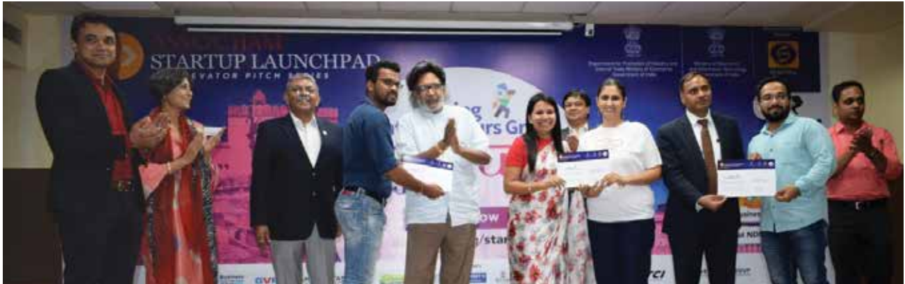
Winners of ASSOCHAM Startup Launchpad held at Jaipur.