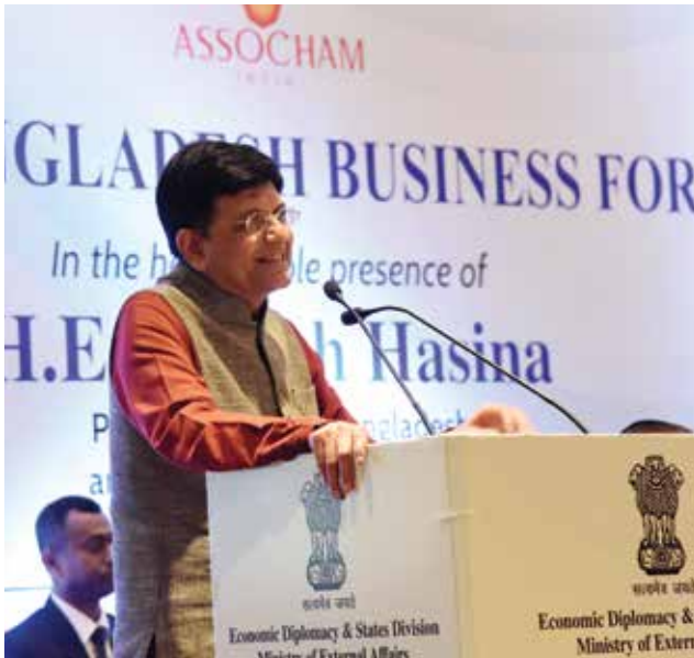
Mr. Piyush Goyal, Hon'ble Minister for Commerce & Industry and Railways, Government of India addressing the India - Bangladesh Business Forum (IBBF) in New Delhi