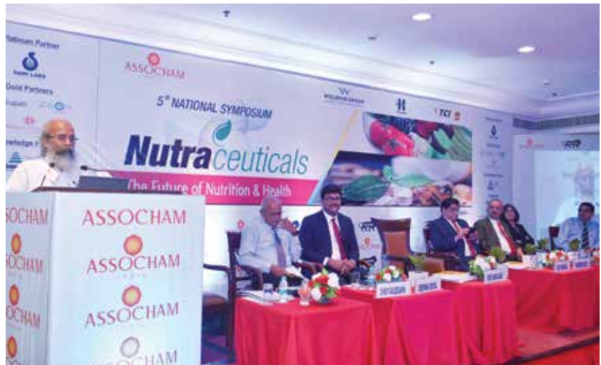
Our Chief Guest for the day, Hon'ble MoS for MSME, Shri Pratap Chandra Sarangi ji addressing the gathering

The Minister further said that only in microscopic cases need