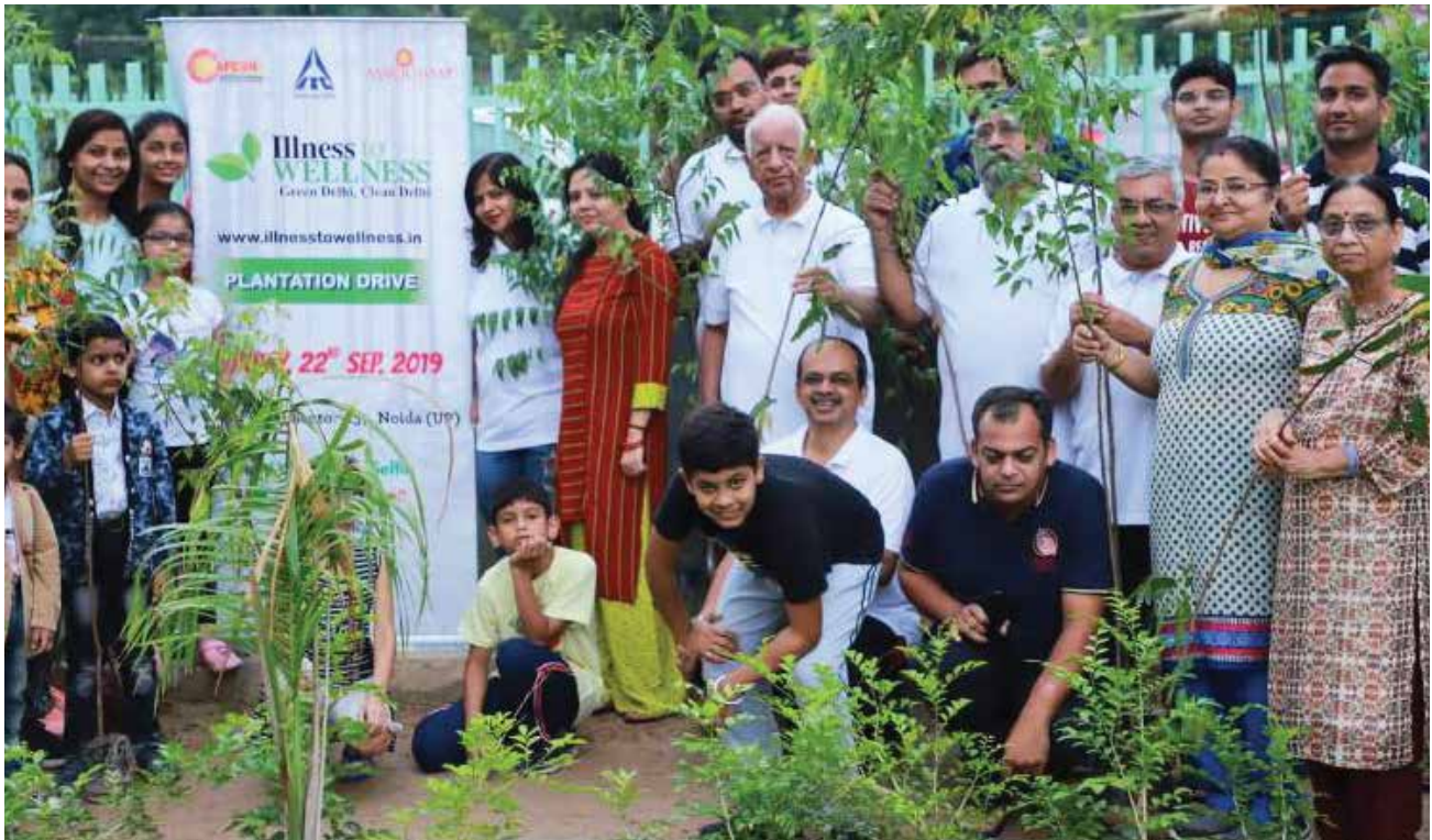
Enthusiastic people of all age group passionately participated in Tree Plantation drive by ASSOCHAM CSR arm and supported by ITC held on 22nd September at Noida