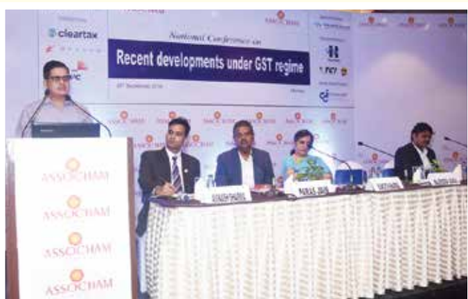
Shri Rajendra Adsul, Joint Commissioner of State Tax (GST),EIU, Govt. of Maharashtra