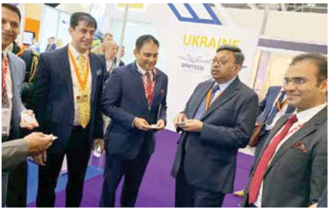
The Secretary (Defence Production), Ministry of Defence, Government of India with the Indian Defence delegation at DSEI 2019.