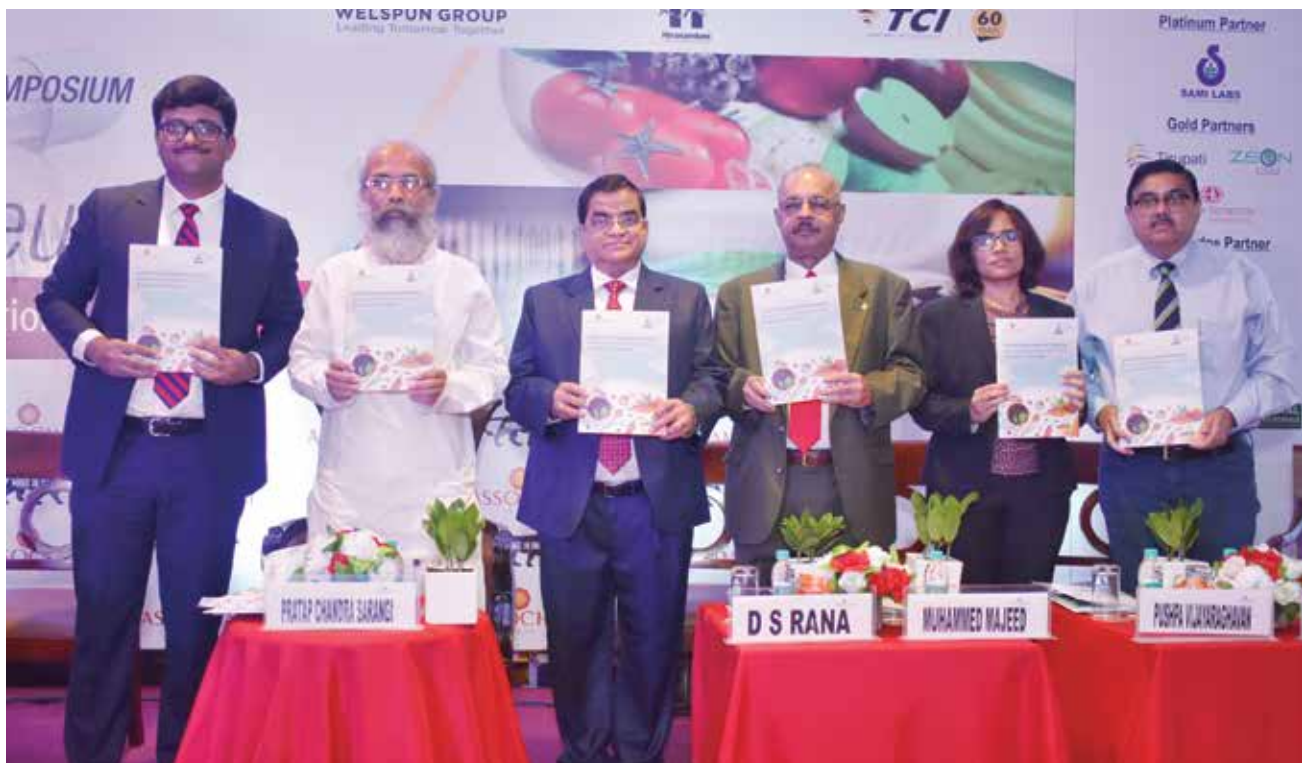
Release of Knowledge paper - INDIAN NUTRACEUTICAL INDUSTRY - BUILDING GLOBAL MOMENTUM AMID REGULATORY CHALLENGES jointly prepared by ASSOCHAM and Sathguru Management Consultants

He said that while it is often considered that ayurvedic doctors are inferior to allopathic