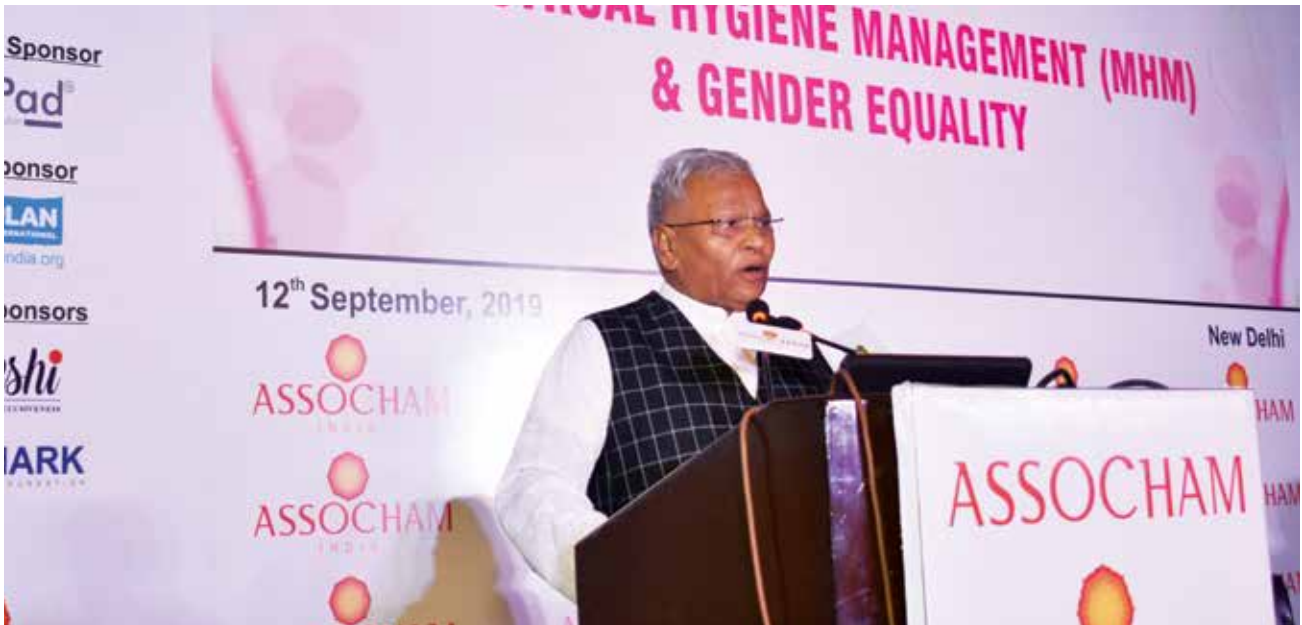
Shri Rattan Lal Kataria, Hon'ble Minister of State for Social Justice and Empowerment addressing the participants ASSOCHAM Conference & Awards: Menstrual Hygiene Management & Gender Equality

options, considering it is a very important social cause, so not just in terms of profit motive but as a sustainable model thereby creating a revolving fund. "It would be desirable to keep it as low-cost product, biodegradable/compostable so that we do not end polluting the environment by piling up plastic waste."