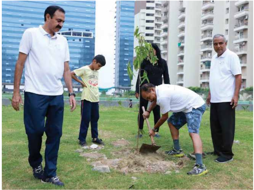
Enthusiasm by all in Tree Plantation drive

Noida Sector 137 have taken a step forward to fight this problem by giving up worry and acting upon it. ASSOCHAM and ITC's initiative 'Illness to Wellness' saw a large number of local residents and green partners 'Volunteers 137' joining the tree plantation drive. The event started at 8 am on Sunday in Central Park where the residents of Sector 137 took part and planted Neem, Ashoka, Amaltas, Madhumati, and Giloe trees. People of all ages attended the event, but special enthusiasm was seen among the children for planting trees. Some young children were seen helping one another to plant trees and water them. Many people present at the event took a green selfie and