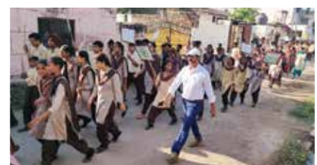
Project activities run by ASSOCHAM CSR arm and supported by Dettol SiTi Shield