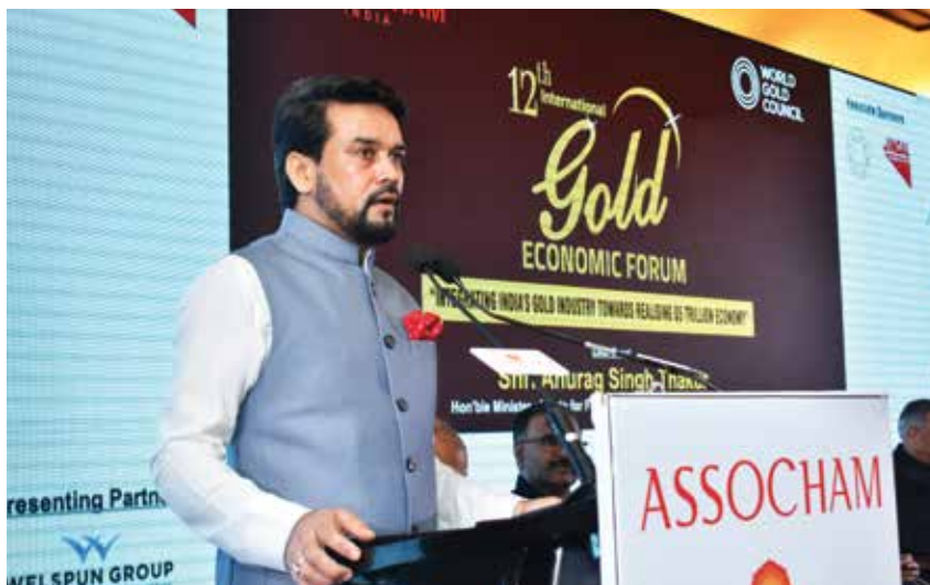
Shri Anurag Singh Thakur, Hon'ble Minister of State for Finance & Corporate Affairs, Government of India

The Minister added, "We can encourage more branches of banks to accept gold deposits under the GMS and also to extend Gold Metal Loans. We have and will continue to support the Gold Industry."