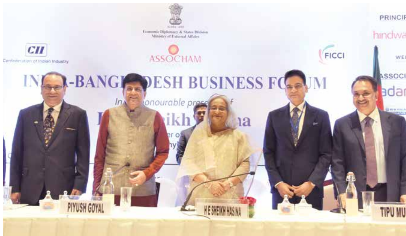
Mr. B. K. Goenka, President, ASSOCHAM and Chairman, Welspun Group with H.E. Sheikh Hasina, Hon'ble Prime Minister of Bangladesh, Mr. Piyush Goyal, Hon'ble Minister for Commerce & Industry and Railways, Government of India, Mr. Tipu Munshi, Hon'ble Minister for Commerce, Government of Bangladesh, and other dignitaries in the Inaugural Session of the India - Bangladesh Business Forum (IBBF) organized in honour of H.E. Sheikh Hasina, Prime Minister of Bangladesh