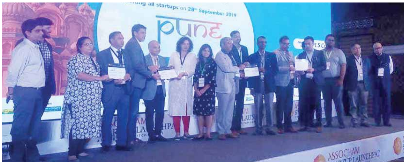
Winners of ASSOCHAM Startup Launchpad held at Pune

The Jury at ASSOCHAM Startup Launchpad selected four winners viz., Jeevtronics, REVY Environment, Thatmateteam and EconovusL from Pune city.