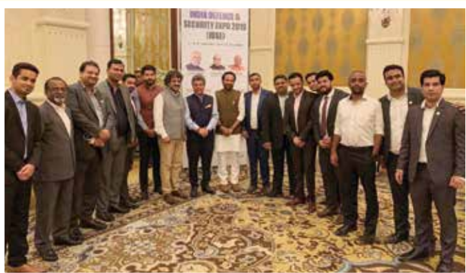
Mr. G Kishan Reddy, Union Minister of State for Home Affairs, Govt. of India along with ASSOCHAM sr. officials.