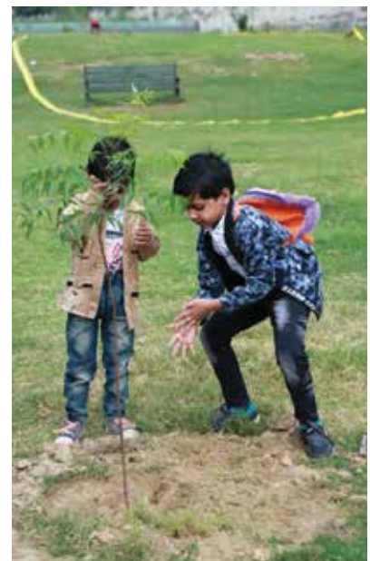
Children are enthusiastically planting the tree

in the tree plantation drive. The event commenced early morning at Vimal Khurana park (Kirti Nagar) where the residents planted variety of trees. People of all ages attended along with children. The gatherings also took a green selfie and pledged to increase and maintain the green cover in the area. Illness to Wellness Drive will be held at various locations in Delhi (NCR) for the next five weeks.