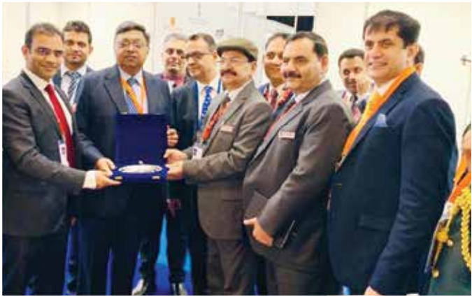
The Indian Delegation receiving the Secretary (Defence Production), Ministry of Defence, Government of India, Shri Subhash Chandra at the DSEI 2019, London, United Kingdom.