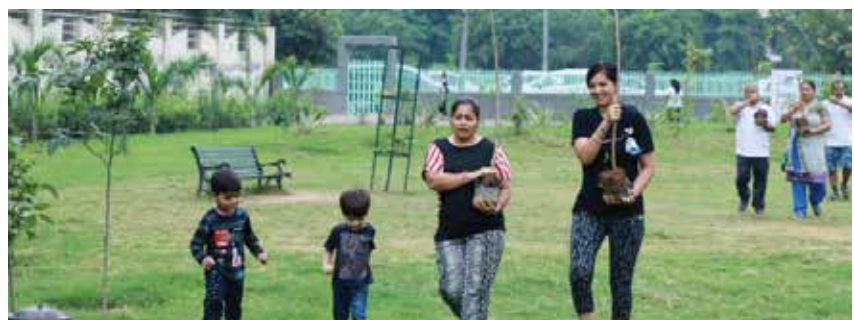
Women and children were also part of Tree Plantation drive on 22nd September at Noida

On Sunday, 22nd September, Noida (Sector 137), took a deep breath of health. While the level of anxiety has increased due to rising levels of air pollution in Delhi (NCR), the people of