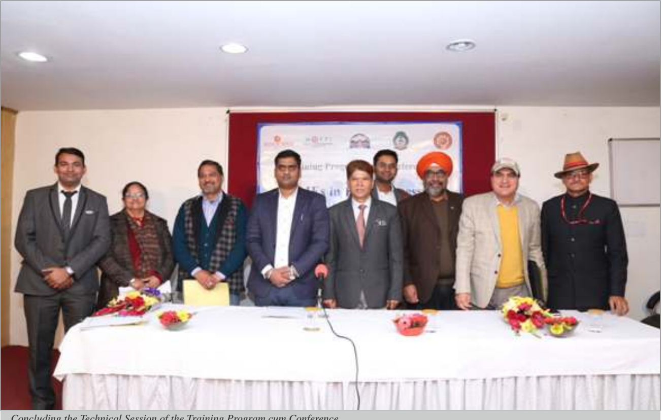
Concluding the Technical Session of the Training Program cum Conference

A day long training program-cum-conference on Micro, Small & Medium enterprises in food processing was organized jointly by the Associated Chamber of Commerce and Industry in India (ASSOCHAM), Ministry of Food Processing Industries, GoI, Punjab National Bank and CSK Himachal Pradesh Agricultural University on January 31, 2019 at CSK HPKV.