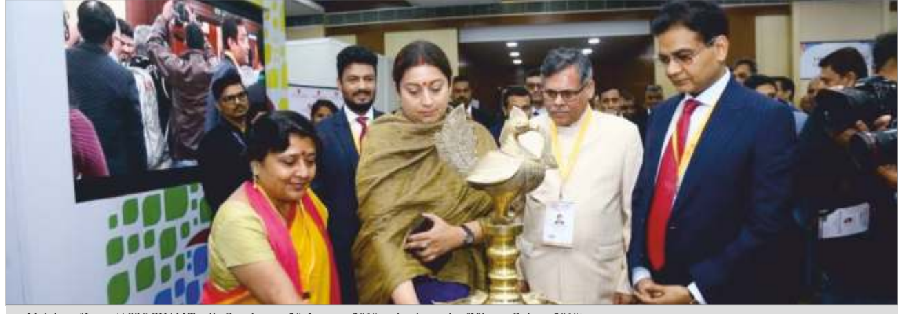
Lighting of Lamp (ASSOCHAM Textile Conclave on 20-January-2019 under the aegis of Vibrant Gujarat 2019)

The Union Government will look into textile industry's apprehensions vis-à-vis embedded duties not being refunded fully and see that no tax is imposed on exports, Union Minister of Textiles Ms Smriti Irani stated at an ASSOCHAM event held in Gandhinagar.