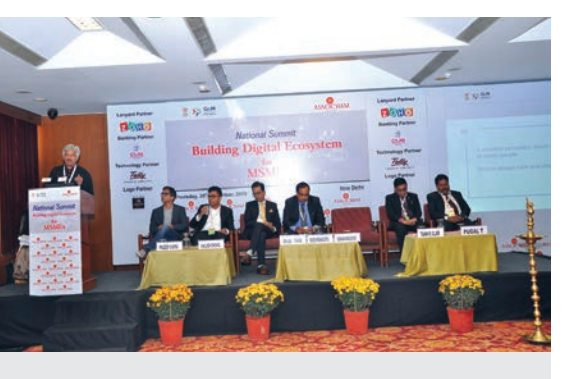
Technical Session - Panel of Speakers