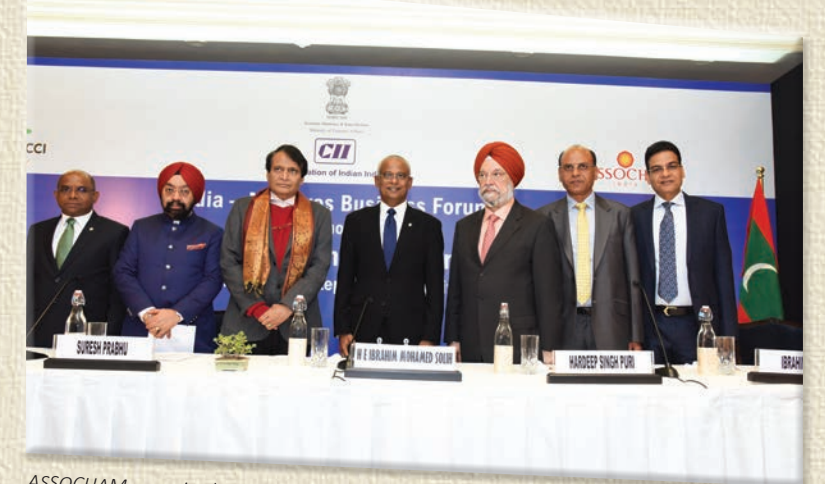
ASSOCHAM organized a Business Forum with Hon'ble President of Maldives and the accompanying delegation on 16th December, 2018 at New Delhi.