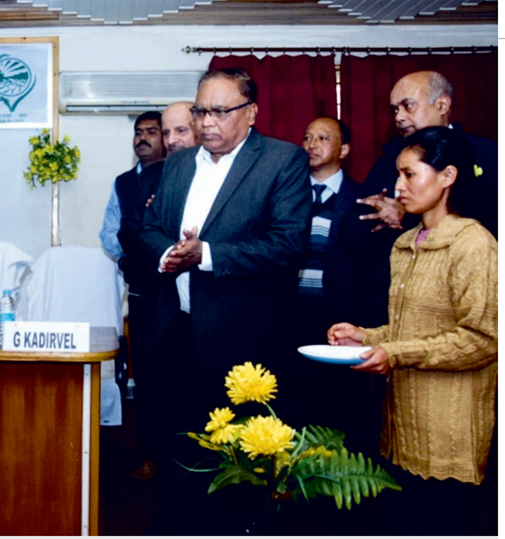
"Startups and MSMEs in Food Processing" on December 11, 2018 at ICAR-RC for NEH Region, Umiam,