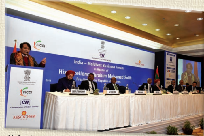
Mr. Suresh Prabhu, Hon'ble Minister of Commerce & Industry and Civil Aviation addressing the India – Maldives Business Forum.