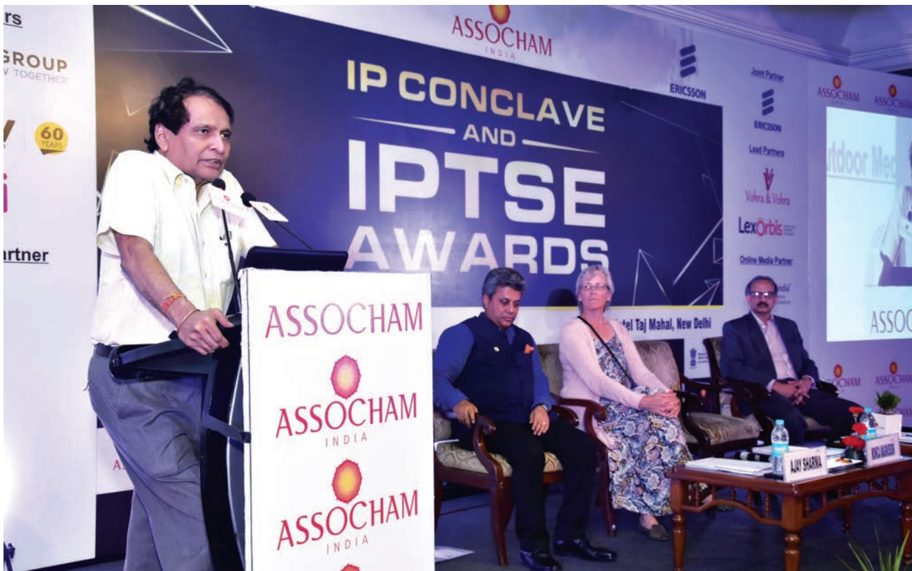
Mr. Suresh Prabhu, Member of Parliament & Sherpa G20 addressing an ASSOCHAM IP Conclave and IPTSE Awards.