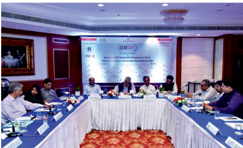
Round table discussion with Architects and MEP Consultants