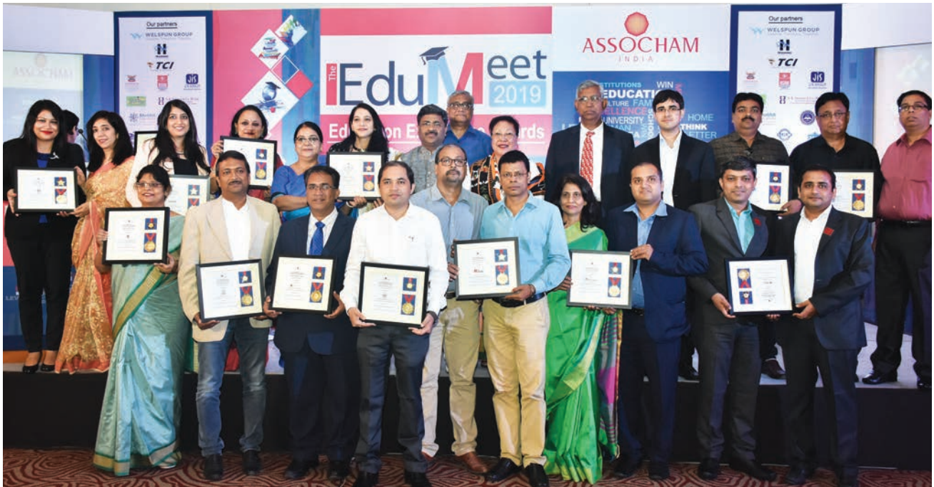
ASSOCHAM Excellence Award Winners