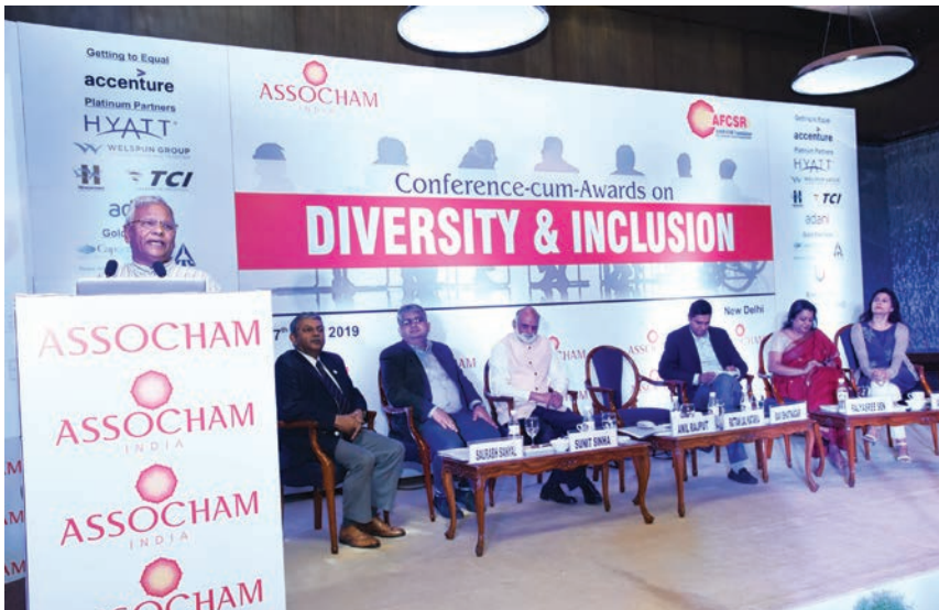
Mr. Rattan Lal Kataria, Hon'ble Minister of State, Ministry of Social Justice & Empowerment and Ministry of Jal Shakti, GoI addressing the Conference

"I urge the corporate sector to strengthen participation of weaker sections of our society, which is also a part of government's agenda," stated Mr Kataria.