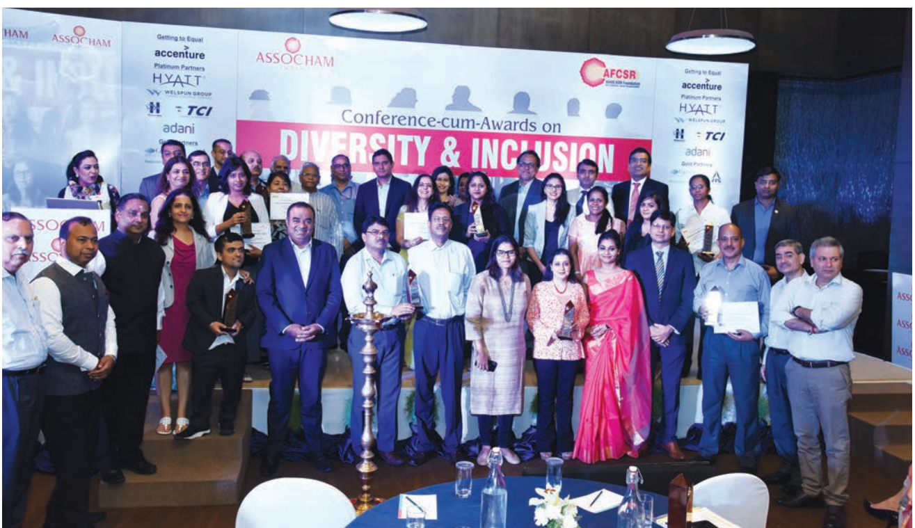
Mr. Rattan Lal Kataria, Hon'ble Minister of State, Ministry of Social Justice & Empowerment and Ministry of Jal Shakti, GoI seen here along with Awardees at ASSOCHAM Conference-cum-Awards on Diversity & Inclusion.