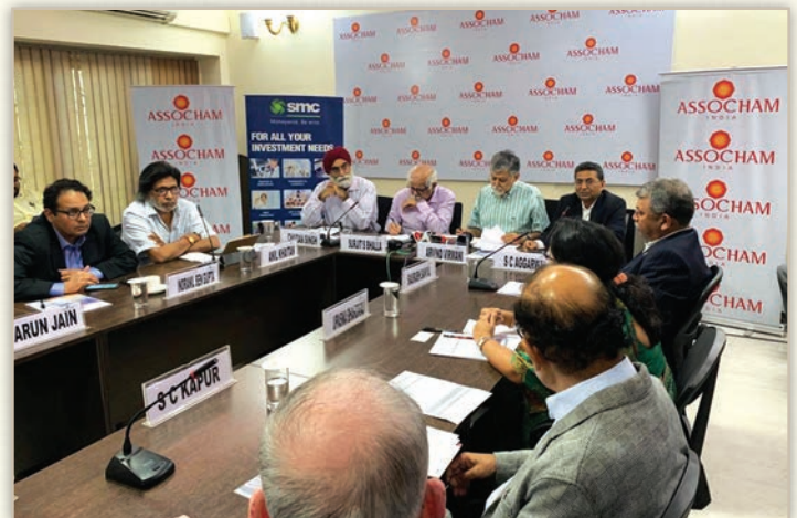
ASSOCHAM-EgrowFoundation Shadow Monetary Policy Committee joint discussion on RBI Monetary Policy at New Delhi.