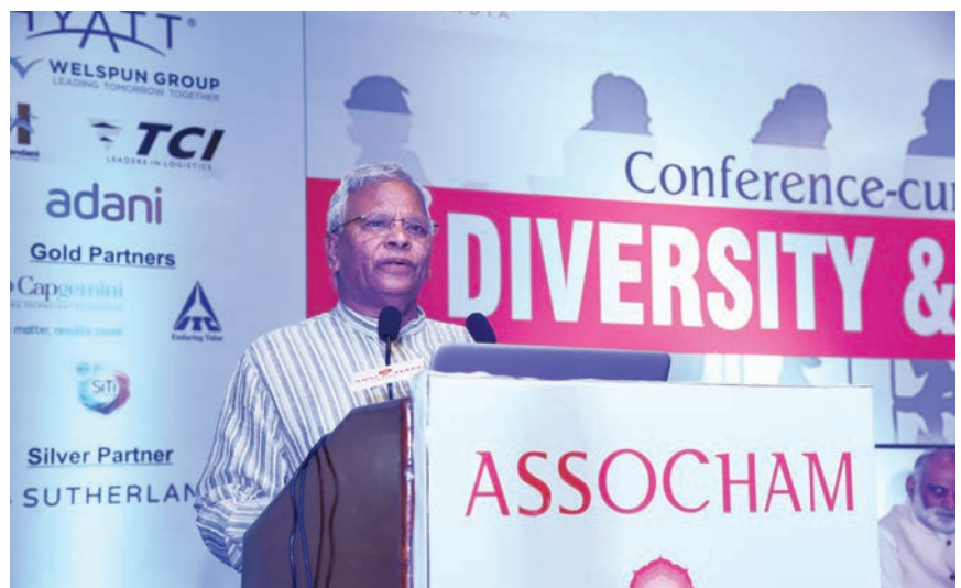
Mr. Rattan Lal Kataria, Hon'ble Minister of State, Ministry of Social Justice & Empowerment and Ministry of Jal Shakti, GoI addressing an ASSOCHAM Conference-cum-Awards on Diversity & Inclusion.

community, weaker sections of society and create a conducive work environment.