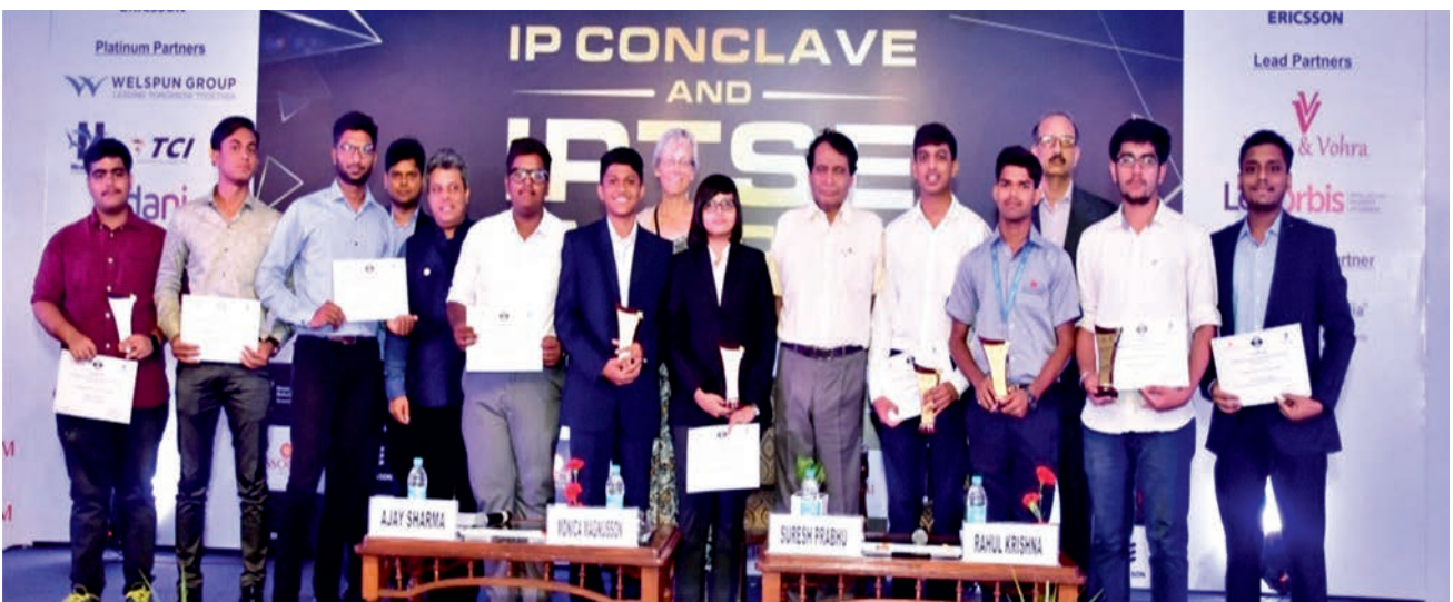
Group Photo of Award winners with the Hon'ble Minister and other dignitaries

While some studies shows that a balanced IPR regime can encourage economic growth and an innovation ecosystem, there is a growing need to drive awareness and mass sensitization of IP among the youth. The IPTSE is a first for India, and is a small but significant step towards encouraging young minds to appreciate the importance of IPR and consider it as a career.