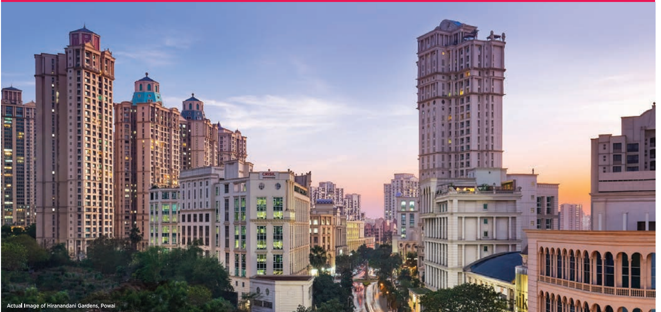
Actual Image of Hiranandani Gardens, Powai

Township Amenities: Hiranandani Foundation School • Multi-specialty Hospital • Clubhouse • Gymnasium • Swimming Pool • Tennis Courts • Shopping Arcade • Landscaped Gardens • Pedestrian-friendly, Tree-lined Avenues