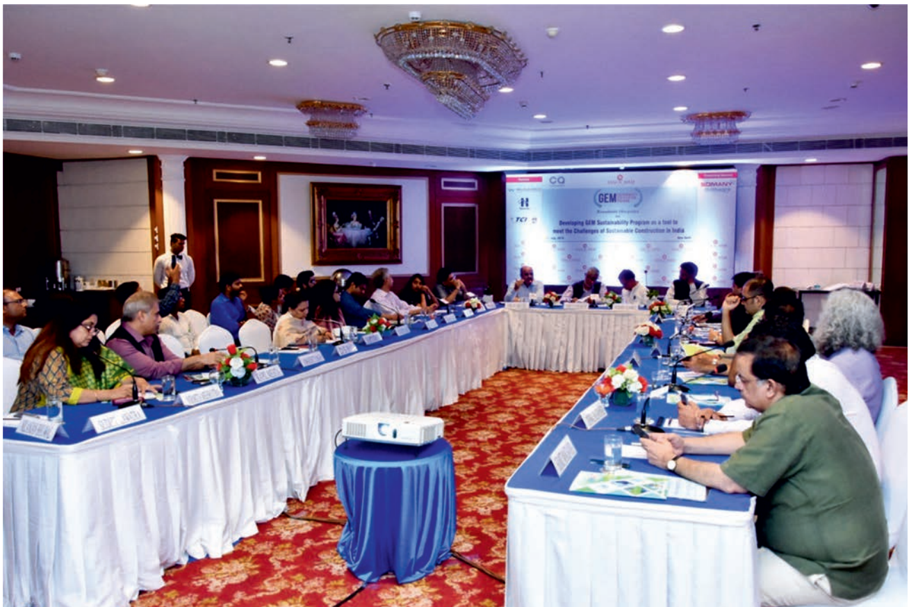
Round table discussion with Architects and MEP Consultants

ASSOCHAM has formed a National Council for Green and Eco-friendly Movement (CGEM) which coordinates the GEM Sustainability Certification Rating Program.