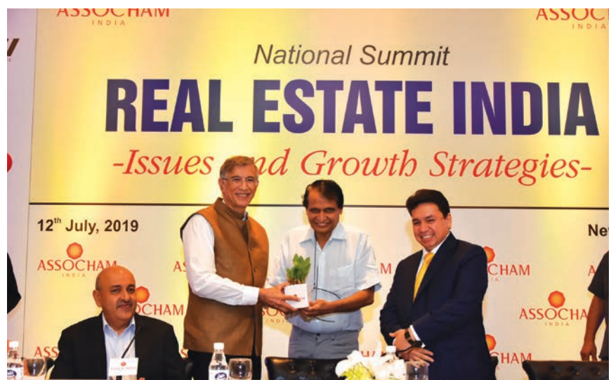
Mr. Niranjan Hiranandani, Senior Vice President, ASSOCHAM welcoming Mr. Suresh Prabbu, Hon'ble Member of Parliament & Sherpa, G20, at the National Summit on “REAL ESTATE INDIA: Issues and Growth Strategies.”

“We are trying our level best to ensure that within this year this seamless facility is extended across