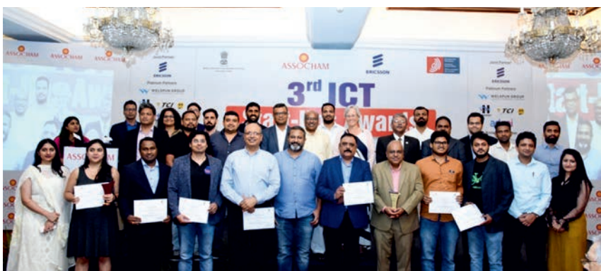
Group Photo of Award winners with the Hon'ble Minister and other dignitaries

The ICT Startups Awards is a collaboration between ASSOCHAM, the Ministry of Electronics and Information Technology, Government of India and Ericsson, and is aimed at promoting innovation through recognition of outstanding ICT innovations. Every year, the awards bring to the fore innovative and disruptive entrepreneurs committed to changing the world one innovation at a time.