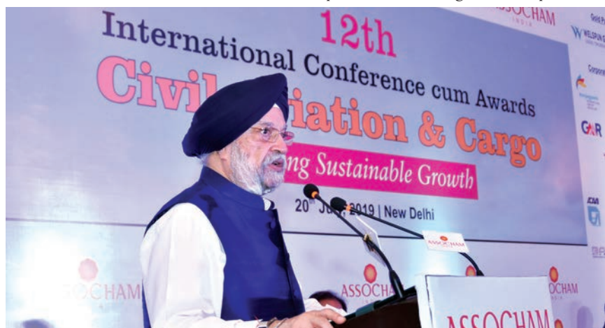
Mr. Hardeep Singh Puri, Minister of State (I/C) for Civil Aviation addressing an ASSOCHAM 12th International Conference-cum-Awards on Civil Aviation & Cargo.

In conformance with the objectives of the holistic National Civil Aviation Policy, 2016, a number of initiatives and measures were taken up to sustain the growth impetus in