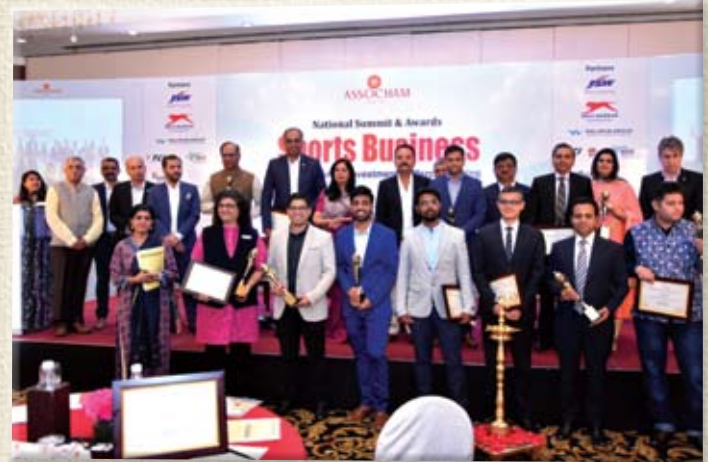
Winners of ASSOCHAM's "Sports Excellence Awards" held on March 28, 2019, at Hotel Shangri-La's Eros, New Delhi