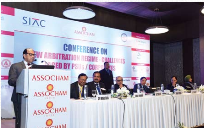
Hon'ble Justice A. K. Sikri, Former Judge, Supreme Court of India delivering his address during the Conference

Hon'ble Justice Dipak Misra, in his inaugural address stressed the need to make India as a hub for international commercial arbitration comparable to other institutions like SIAC, London Court of Arbitration etc. He supported institutional arbitration in comparison to ad-hoc arbitration. He informed that courts have taken a supportive view on the role of institutional arbitration in settlement of commercial disputes.