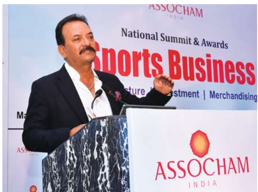
Guest of Honour, Shri Madan Lal, Former Indian Cricketer, Indian Cricket Team Coach & Member, World Cup India's Squad addressing the Sports Business Summit & Awards.

The collaborative efforts by the private and public sector can promote overall infrastructure development in the sports industry in India. The private sector is a key stakeholder in the Indian sporting ecosystem. In particular, for sports infrastructure development,