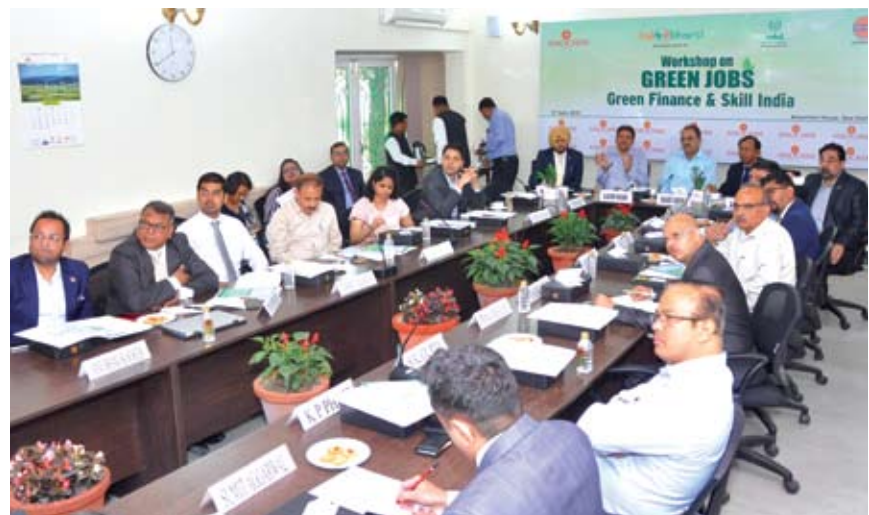
Eminent Dignitaries along with participants during Workshop on Green Jobs, Green Finance and Skill India held on 12-4-2019