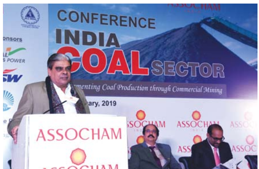
Mr. Haribhai Parthibhai Chaudhary, Hon'ble Minister of State for Mines and Coal, Government of India addressing the Conference.

number of days for coal stocking, he said, "Our approach for 24 hour electricity supply has resulted into increased supply of coal to the