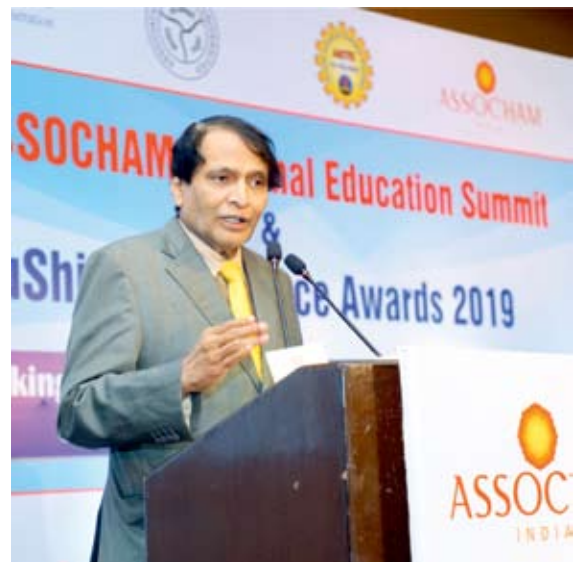
Mr. Suresh Prabhu, Hon'ble Minister for Commerce and Industry and Civil Aviation addressing the august audience.

He also stretched upon the huge challenges faced by the sector in terms of accessibility, equity and quality. He said, "We have highlands of excellences but there is vast presence of mediocrity. This can be eradicated and we can be in par with standards offered