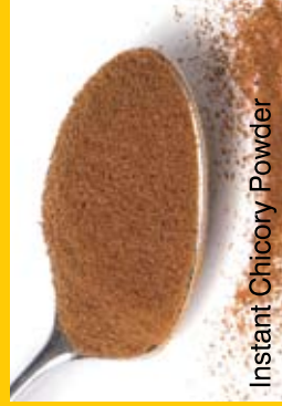
Instant Chicory Powder