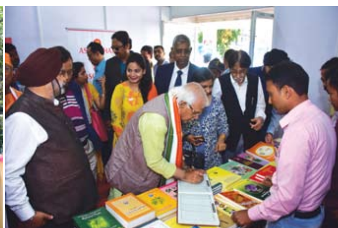
Mr. Sobhandeb Chattopadhyay, Hon,ble Minister-in-Charge, Department of Power & Non-Conventional Energy Sources, Govt. of West Bengal giving his comments on visitors book.