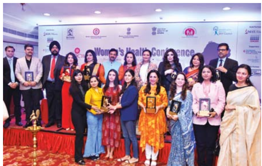
Awards Winners at ASSOCHAM Women's Health Conference 2019