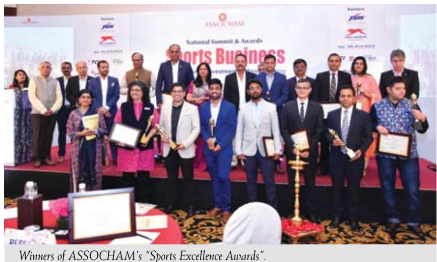
Winners of ASSOCHAM’s “Sports Excellence Awards”.