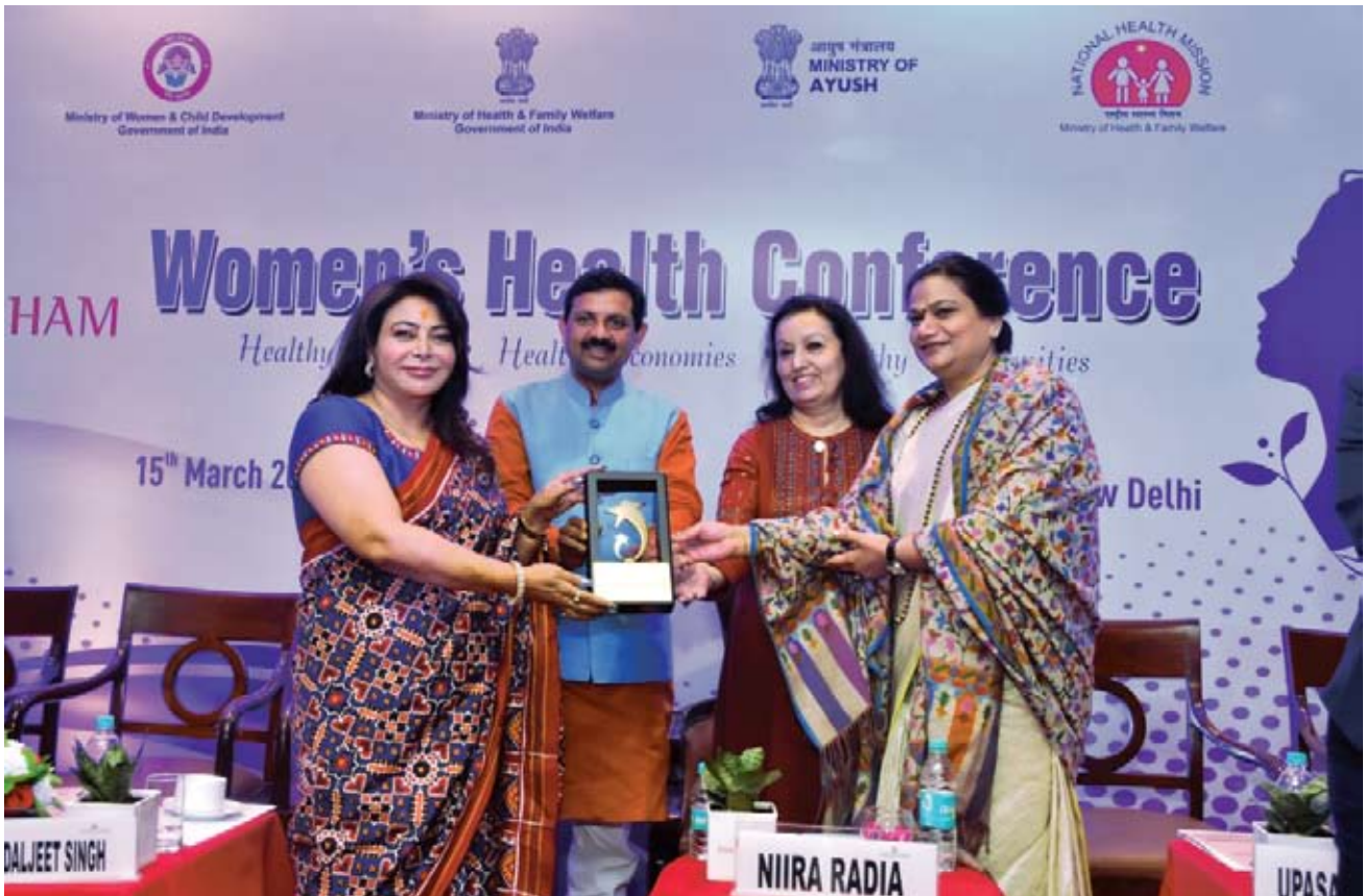
Ms. Niira Radia, Promoter & Chairperson, Nayati Healthcare Pvt. Ltd. receiving the award for Most Innovative Healthcare Brand.