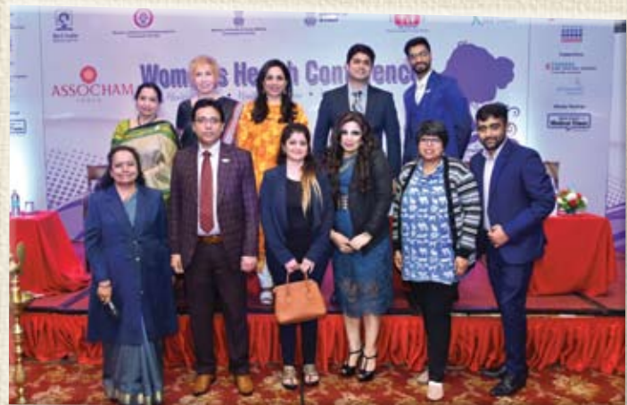
ASSOCHAM Health and Pharma Division with the distinguished guests at ASSOCHAM Women's Health conference