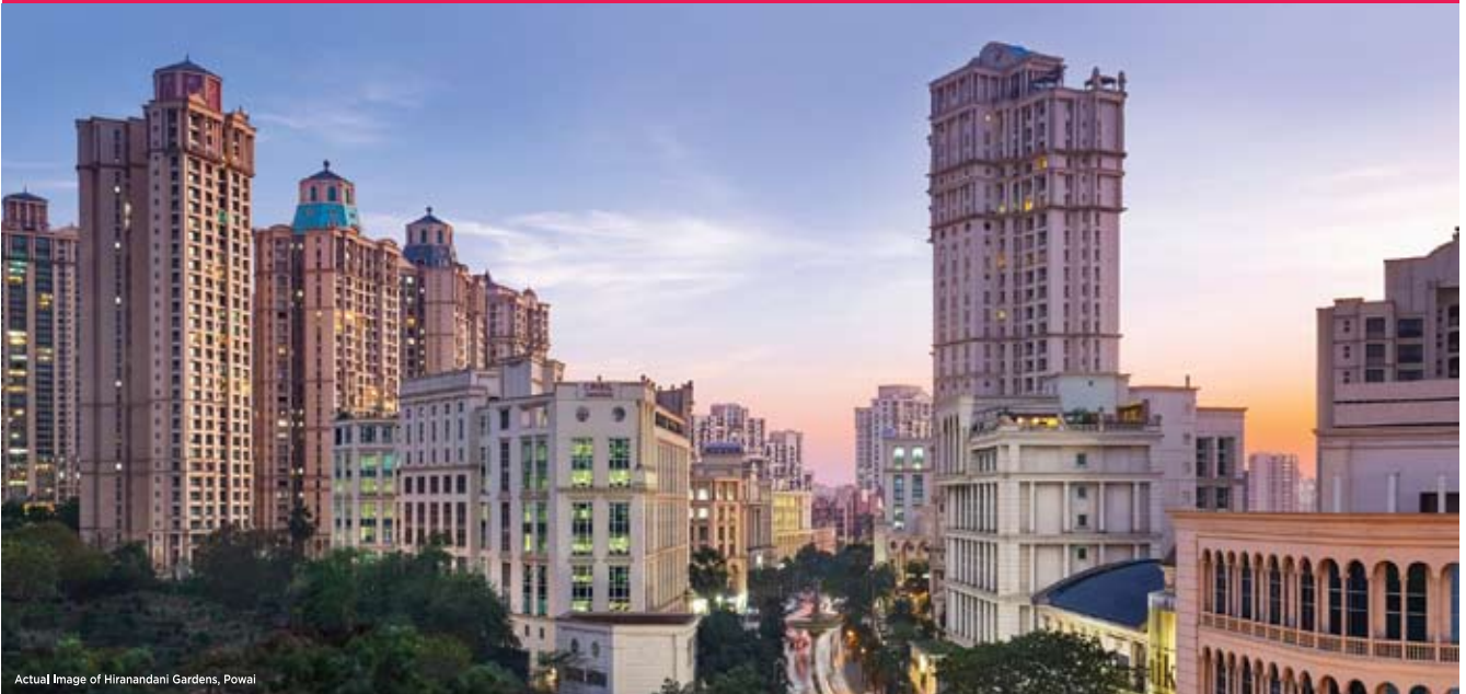
Actual Image of Hiranandani Gardens, Powai

Township Amenities: Hiranandani Foundation School • Multi-specialty Hospital • Clubhouse • Gymnasium • Swimming Pool • Tennis Courts • Shopping Arcade • Landscaped Gardens • Pedestrian-friendly, Tree-lined Avenues