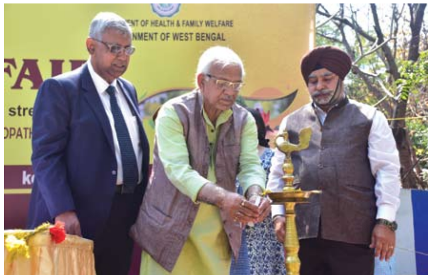
Lighting the lamp by Mr. Sobhandeb Chattopadhyay, Hon,ble Minister-in-Charge, Department of Power & Non-Conventional Energy Sources, Govt. of West Bengal.

The event was inaugurated by Hon'ble Minister of Power and Non Conventional Energy Sources Government of West Bengal and MLA, Rash Behari Constituency Shri Sobhandeb Chattopadhyay. The program witnessed visit of more than 20,000 visitors from various strata of the society from professions as diverse as government officials to corporate to armed force families to university students to housewives