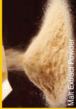
Malt Extract Powder

office@pmvnutrient.com | www.pmvnutrient.com