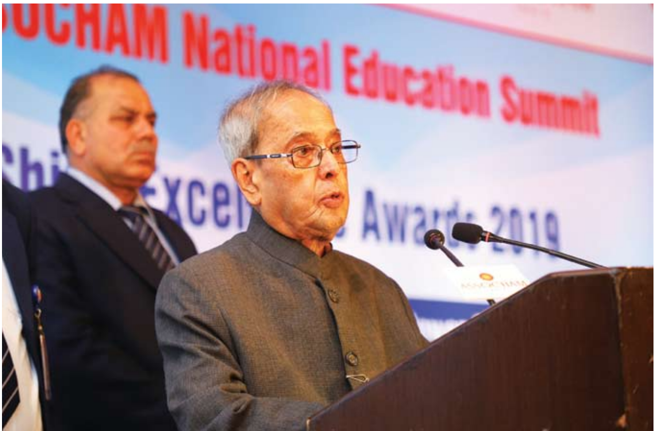
Bharat Ratna Shri Pranab Mukherjee, Hon'ble Former President of India addressing the auspicious audience.