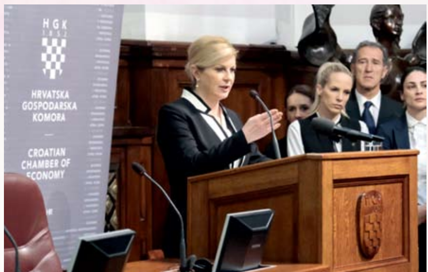
H.E. Ms. Kolinda Grabar-Kitarović, Hon'ble President of the Republic of Croatia, addressing the audience during Croatia-India Business Forum.