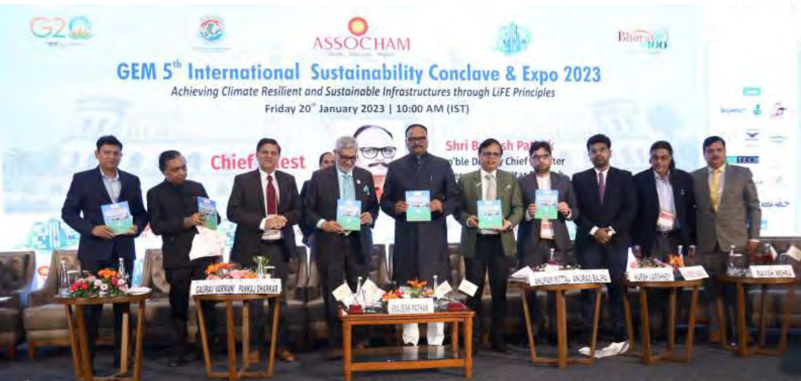
The GEM 5th Sustainability Conclave and Expo 2023 witnessed the launch of ASSOCHAM Carbon Footprint Assessment and Rating program (ACFAR) by the Chief Guest of the event, Honble Deputy Chief Minister of Uttar Pradesh, Sh. Brijesh Pathak.