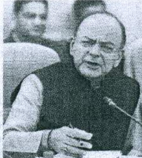
Finance Minister Arun Jaitley