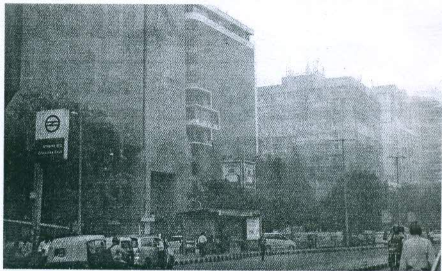
Smog covers Delhi's skyline as pollution remains at a high level on Friday.

It said the feedback from tour operators and hoteliers