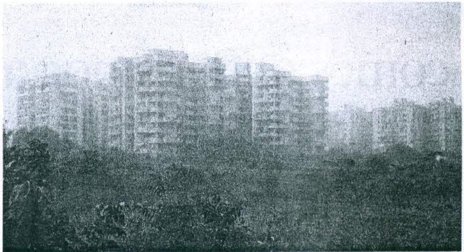
Missing clarity: Smog engulfs Dwarka in New Delhi on Friday.

"Delhi is facing an emergency situation but there is hardly any intention or commitment seen to address the problem with in-