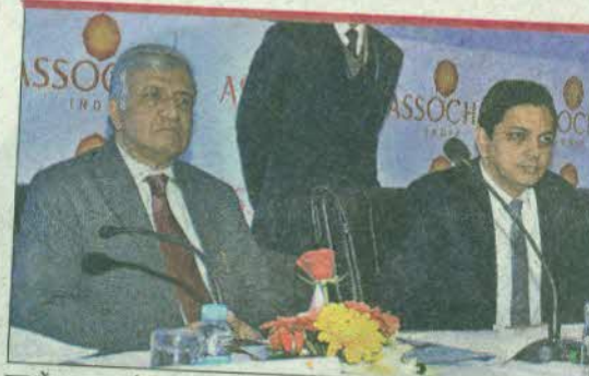
दून में शुक्रवार को एसोचैम के कार्यक्रम में पहुंचे गवर्नर डॉ. केके पॉल।

स्विट्जरलैंड, न्यूजीलैंड से सीखें: राज्यपाल ने कहा कि कोको का उत्पादन न होने के बावजूद स्विट्जरलैंड बेहतरीन